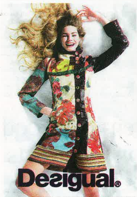
Colorful: A Desigual advertisement.

Desigual's debut on the Third Street Promenade underscores a shift that's occurred within the shopping district. The corner of Third and Broadway – former home of the Broadway Deli – is no longer the quiet end of the street. It's now a heavily trafficked intersection bustling with shoppers headed to Santa Monica Place's trendy retailers and restaurants from the Promenade.